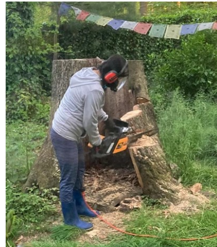
Les' March carvings