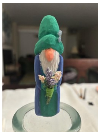
Wendy N— Gnome